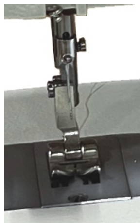
Closeup of needle